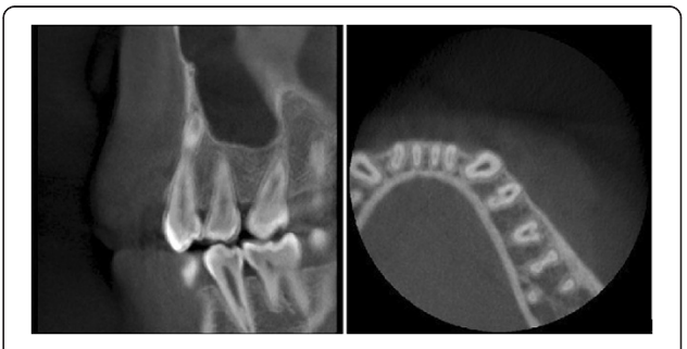
Figure 3 C-shaped canal configuration in a mandibular second premolar at the middle–apical part of the canal in cross-sectional view.

Type I = 151 (86.8%), Type III = 3 (1.7%), Type V = 17 (9.8%), Type VIII = 1 (0.6%) (Figure 1), while two teeth had a C-shaped configuration (1.1%) (Figure 2). Four of the mandibular first premolars had two roots and two canals (one canal in each root) (Table 2). All 178 mandibular second premolars were single-rooted and the canal configurations of these teeth according to Vertucci's classification were Type I (173 teeth, 97.2%), Type II (one tooth, 0.55%) and Type V (3 teeth, 1.7%); one tooth had a C-shaped configuration (0.55%) (Figure 3, Table 3). In both first and second mandibular premolar teeth exhibiting Type V or Type VIII morphology, the canal bifurcation occurred at the middle-apical part of the